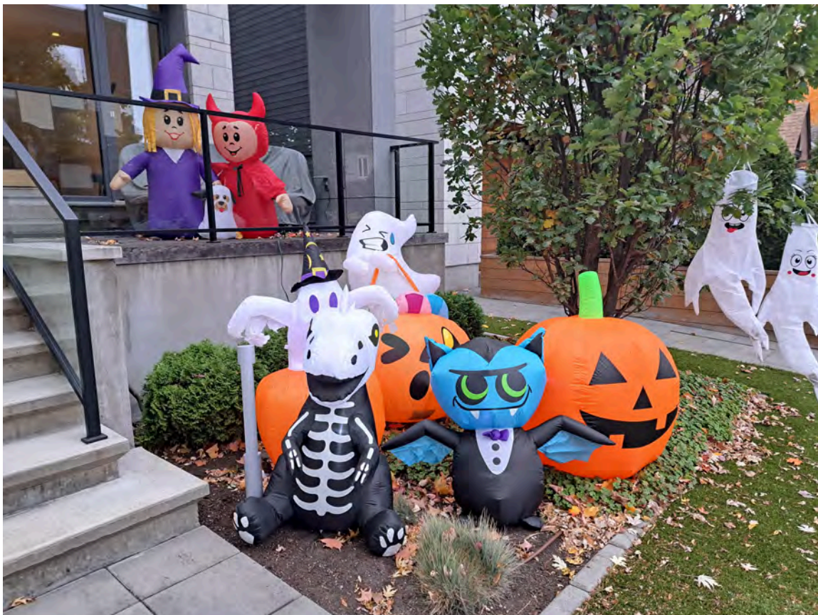
Friendly spooks adorned the front of this Merritt Avenue household waiting to greet young neighbourhood trick or treaters.

And we are hard at work redesigning our website at www.mainstreeter.ca . Look for it before the New Year. It's just one of the ways we at The Mainstreeter intend to celebrate our 40th birthday of publication (1985-2025). It's shaping up to be quite a year for our community, and for our community newspaper!